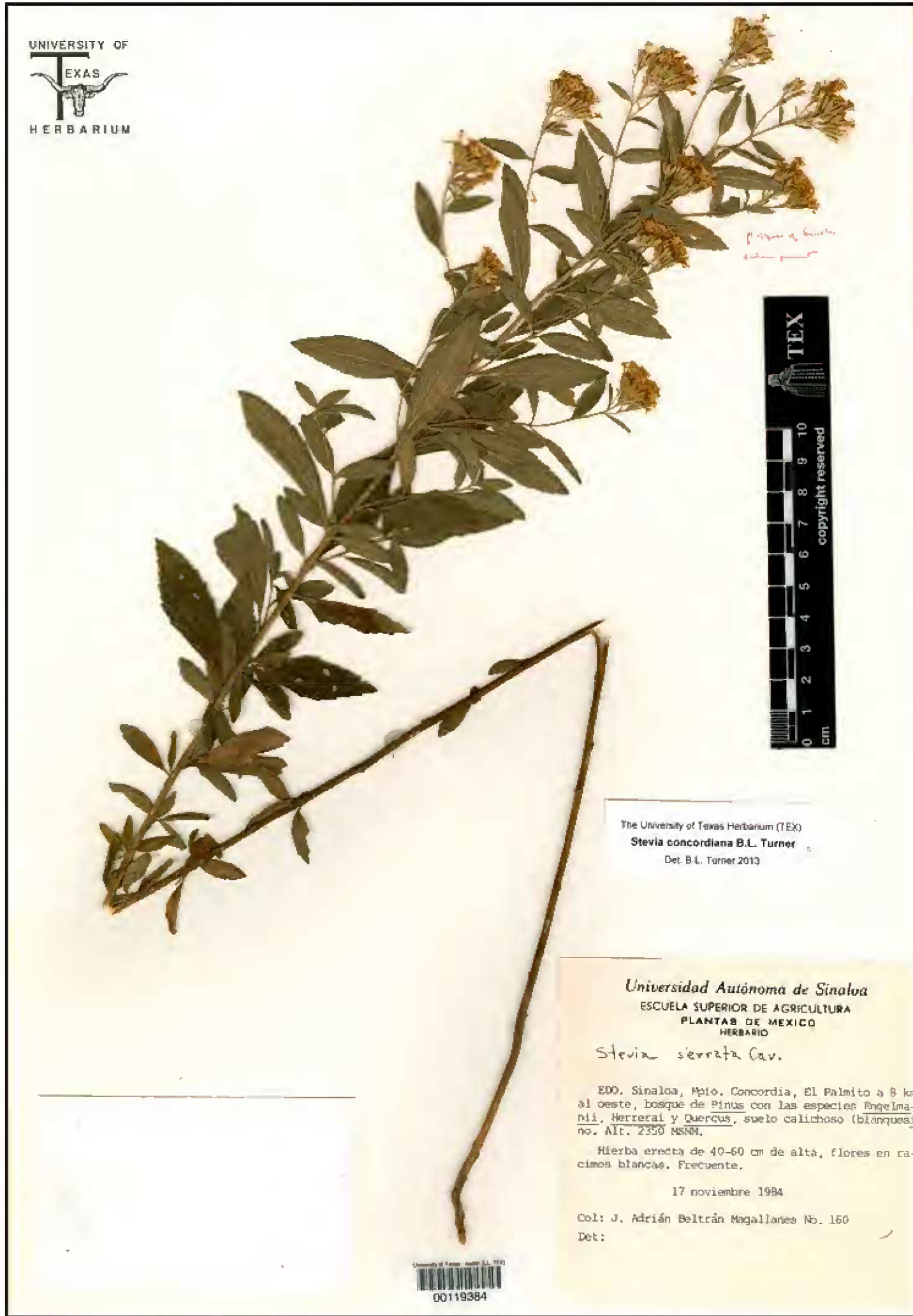
Fig. 1. Stevia concordiana (Holotype: TEX).